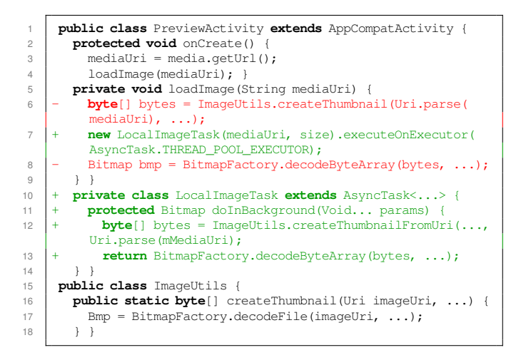
Fig. 4. Image decoding in UI event handlers in WordPress issue 5777 (simplified)

These anti-patterns are a firm basis for developing effective static analysis techniques for detecting IID issues, which are further discussed in Section IV and evaluated in Section V.