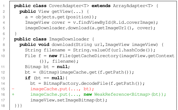
Fig. 5. Unbounded image caching in Atarashii issue 6 (simplified)

Image decoding without resizing. IID issues are likely to present if an image potentially from external sources (like network or file system) is decoded with its original size. Furthermore, external-source image displaying is specific as a few APIs, which can be detected by a pattern-based analysis.