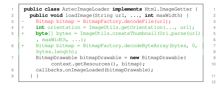
Fig. 2. Image decoding without resizing in WordPress issue 5701 (simplified)